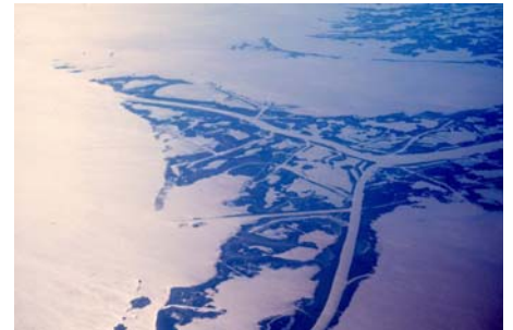
Mississippi River delta.

Characteristics of Oil: The type of oil, its concentration and the types of hydrocarbons it contains influence the rate of biodegradation. The Gulf spill released light, sweet crude oil, which is more readily broken down than heavy, sour oil. “Mousse,” tar balls or oil slicks that wash onshore are highly concentrated compared to dispersed oil, more protected from wind and wave action than oil in open water and have less surface area for microbes to access. Smaller droplets of oil are more biodegradable.