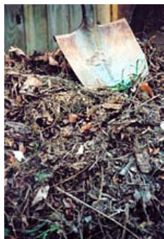
Biodegradation at work in a compost heap.

Earth Gauge's Gulf Oil Spill series focuses on unique topics related to the Gulf of Mexico and the effects of the 2010 oil spill. All fact sheets, images and videos are freely available for use on-air and are available online at http://www.earthgauge.net/2010/gulf-oil-spill-resources .