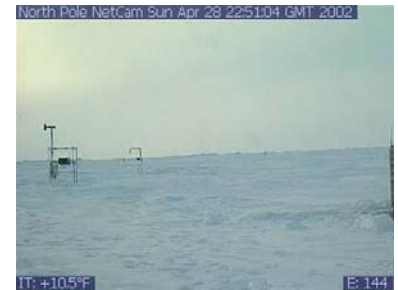
Webcam image of the North Pole, April 2002.

In mid-winter at the North Pole, temperatures can be 15 to 45 degrees below zero Fahrenheit compared to an average of 32 degrees Fahrenheit in summer. During winter, the only light that occurs at the Pole comes from stars, the moon and the Aurora Borealis, also known as Northern Lights.