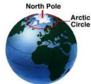
The geographic North Pole.

There are actually two North Poles on Earth: the geographic Pole and the magnetic Pole. They are not in the same location. The geographic Pole is at a fixed location 90 degrees latitude north of the equator, at the top of Earth's axis. The magnetic Pole moves; it is the point at which Earth's magnetic field is exactly 90 degrees perpendicular to Earth's surface (currently located over Northern Canada, 1,000 miles south of the geographic Pole!). The magnetic Pole is the North that magnetic compasses are drawn to. The same is true for the South Pole. For the purposes of this fact sheet, "North Pole" will refer to the geographic North Pole.