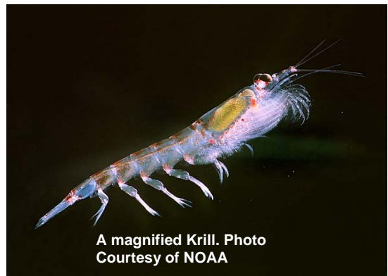
A magnified Krill.

A Program of the National Environmental Education Foundation 4301 Connecticut Avenue, NW, Suite 160 Washington, DC 20008 www.earthgauge.net www.neefusa.org