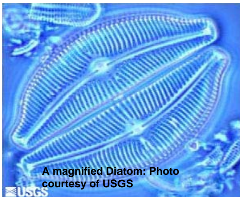
A magnified Diatom